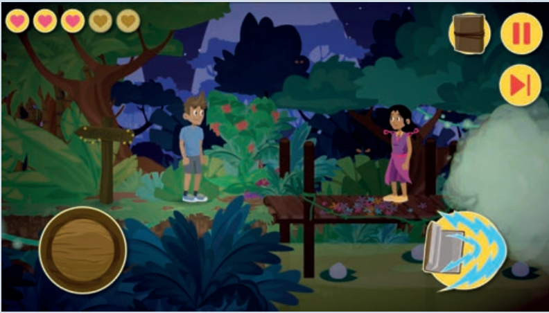
Encounter on Jungle Lady Island: a scene from the app. lovelandgame.org