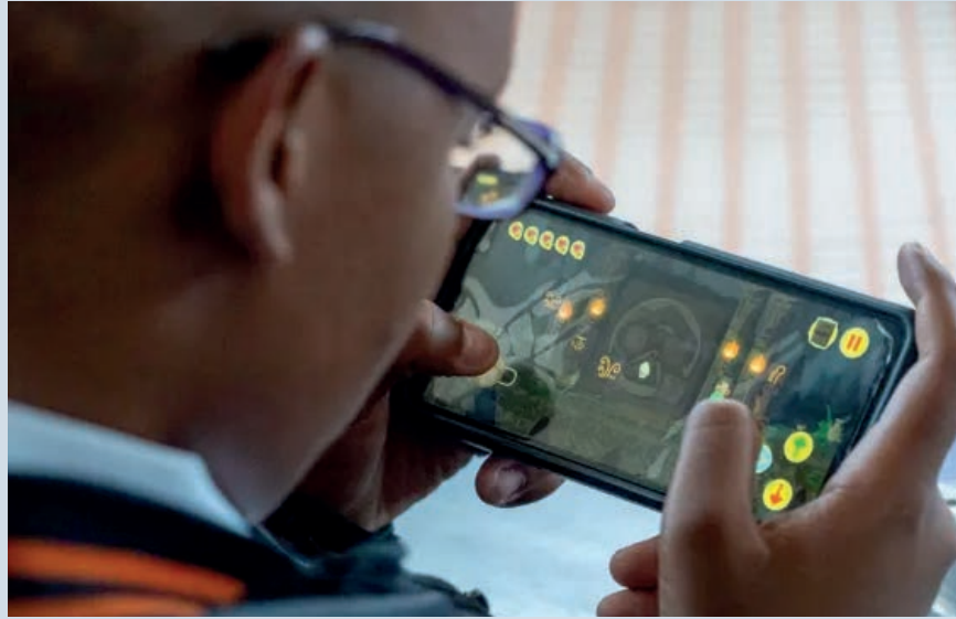
A boy is engaged in the game. Gamification turns the application into an exciting adventure.